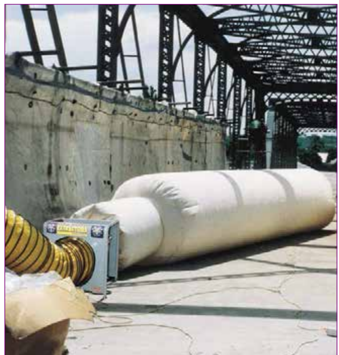
Built to last – the Blue Wizard is tough enough to withstand the harshest blasting conditions.