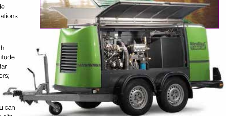
The NEW UltraBlast® TrailerJet™ – compact, professional and portable water blasters.