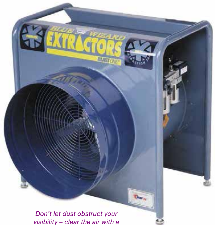
Don't let dust obstruct your visibility – clear the air with a Blue Wizard extraction fan.

Suck dust out fast or blow it away at up to 10,000cfm with power-packed Blue Wizard fans. Stop the down time and start blasting!