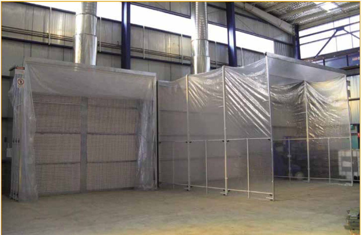
Enviromax™ Retractable Spray Booths showing both opened and closed positions.

Call Blast-One on 1800 190 190 to order your retractable spray booth.