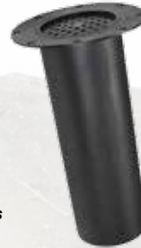
Breathing Air Filter Cartridges