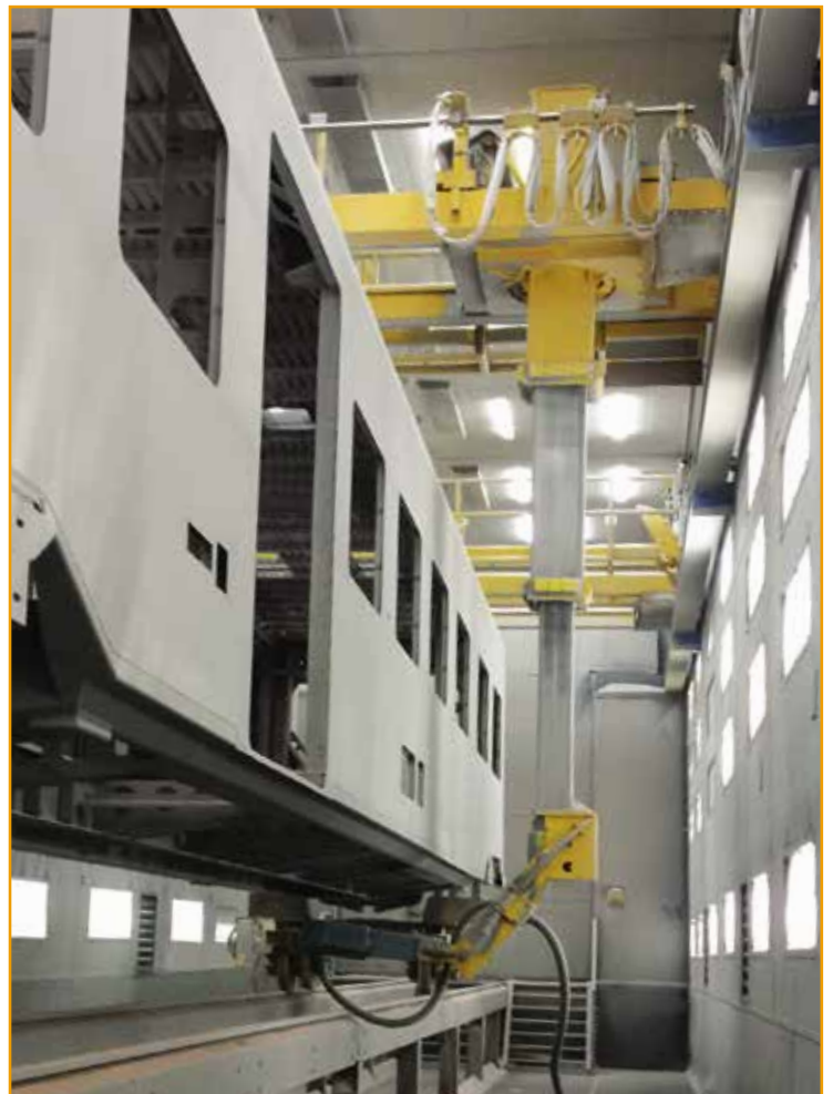
Robotic technology can transform your productivity!

Another benefit of robotics for the abrasive blasting industry is improvements in quality. Again, the tirelessness of a robot ensures quality levels do not fall away due to fatigue or distraction.