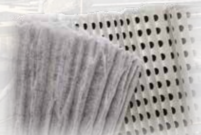
Pleated Paper Spray Booth Filters