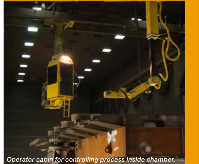
Operator cabin for controlling process inside chamber.

MULTIPLE MOUNTING OPTIONS TO SUIT YOUR APPLICATION