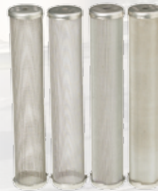
Graco Pump Outlet Filter Meshes