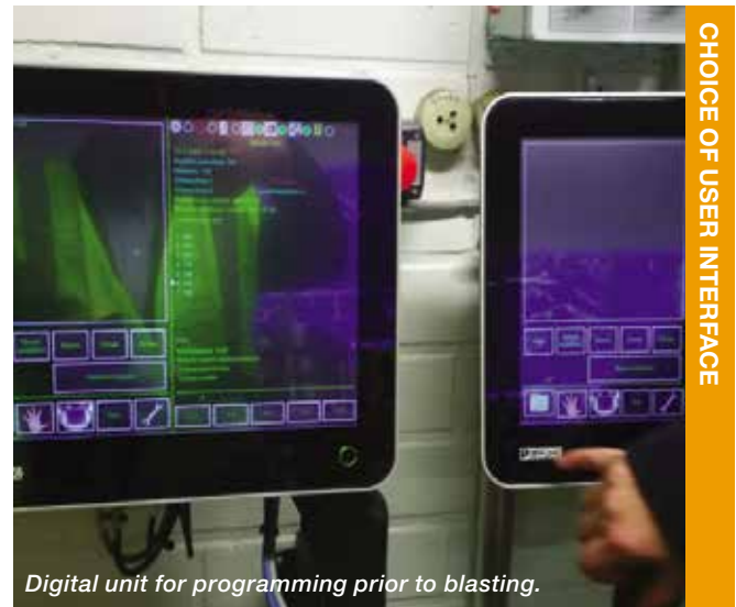
Digital unit for programming prior to blasting.