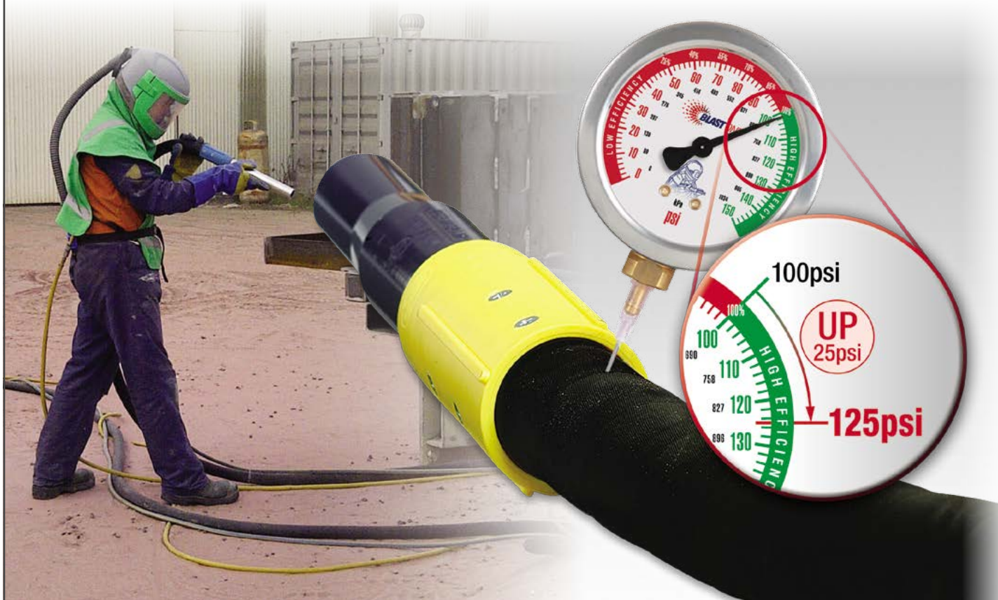
Approximate Blasting Speed at Elevated Pressures

Increase your Blasting Efficiency by blasting ABOVE 100psi!